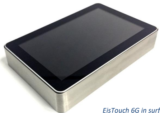
EisTouch 6G in surface mounting frame